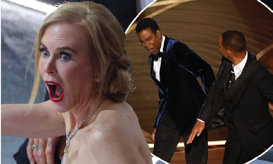
Will Smith – Slap