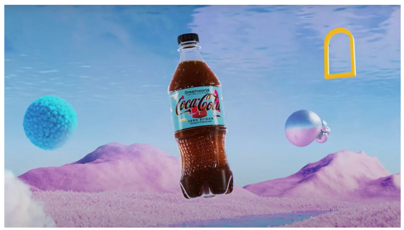
Coca-Cola Dreamworld Image

Growing up, I never reached for a Vanilla or Cherry coke. A plain old coke was good enough for me. But...we're seeing new flavor variations like Starlight, Byte, and musician Marshmello's strawberry and watermelon coke.